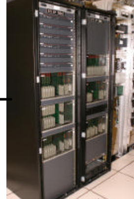
Zetron's Radio Controller