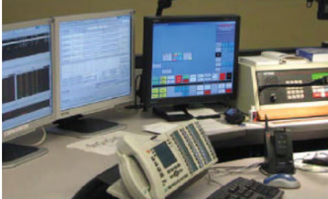
Zetron's Console system